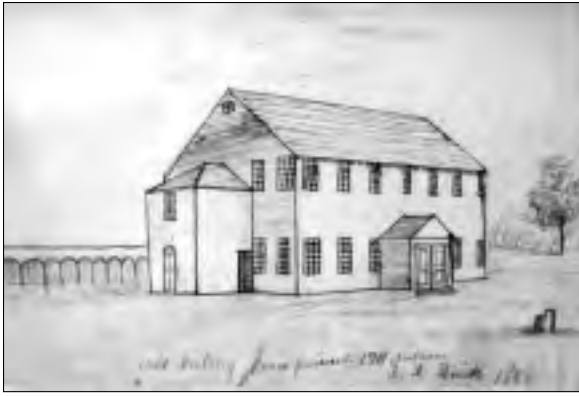
The second Meeting House as it probably looked in 1774.