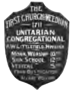
Sign on outside of church, World War I era.