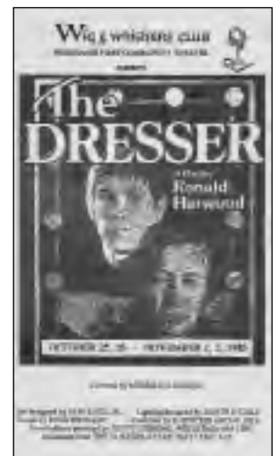
Wig & Whiskers, a theatre group based in First Parish, gave its last performance in 1989.