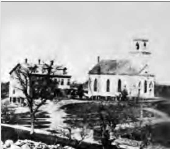
Early photograph of 3rd Edifice, constructed on Nehoiden Street, 1836-1837