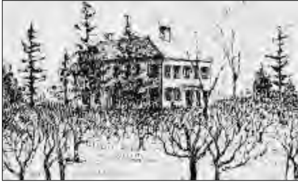
The Townsend House, as it appeared at the time of the Revolutionary War.

T HE TOWN OF NEEDHAM AND THE FIRST CHURCH HAD THEIR BEGINNING AT THE SAME TIME. The Massachusetts Bay Colony was a theocracy and no town could be incorporated without the promise to support a licensed minister of religion.