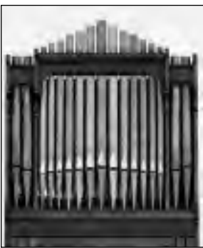
The church acquired a Hook & Hastings organ in the summer of 2005.