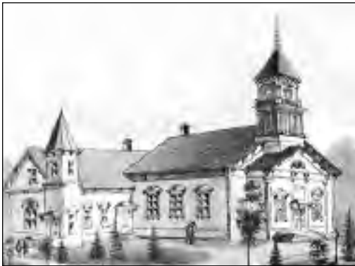
The church in its new location in 1880, one year after its move ( top ) and showing the addition of Parish Hall in 1888. ( bottom )

separate town, but was frustrated by the delay caused by the Civil War, moved towards achievement of its dream. This was finalized in 1881 by the formation of the Town of Wellesley. First Parish members foresaw that Central Avenue would no longer be the center of town and voted to move the church building in 1879. In March the 73-day journey began, with the church dragged on rollers across one and one-half miles of wetlands which today are full of homes. At one period there was a thaw so that the procession had to wait until the ground refroze. On May 20 the move was complete. It is interesting to note in Clarke’s History that the Evangelical Congregational Church offered the use of their Chapel to the First Parish from 2 P.M. to 6 P.M. each Sabbath “while their house of worship is being repaired.”