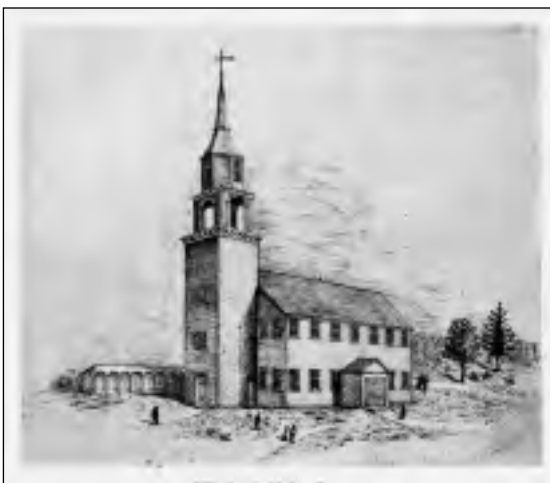
The 1774 Meeting House, showing the steeple that was erected in 1811.