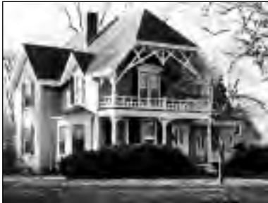
(Top) A 1969 model of the Meeting House moved to Warren Street, with new addition.