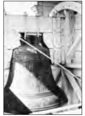
The Paul Revere Bell at First Parish.