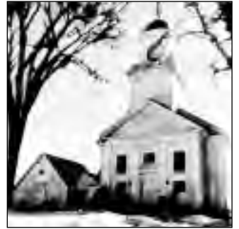
The church as it appears today.