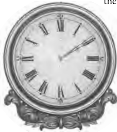
The wall clock, given to the church in 1837, still hangs in the Sanctuary.