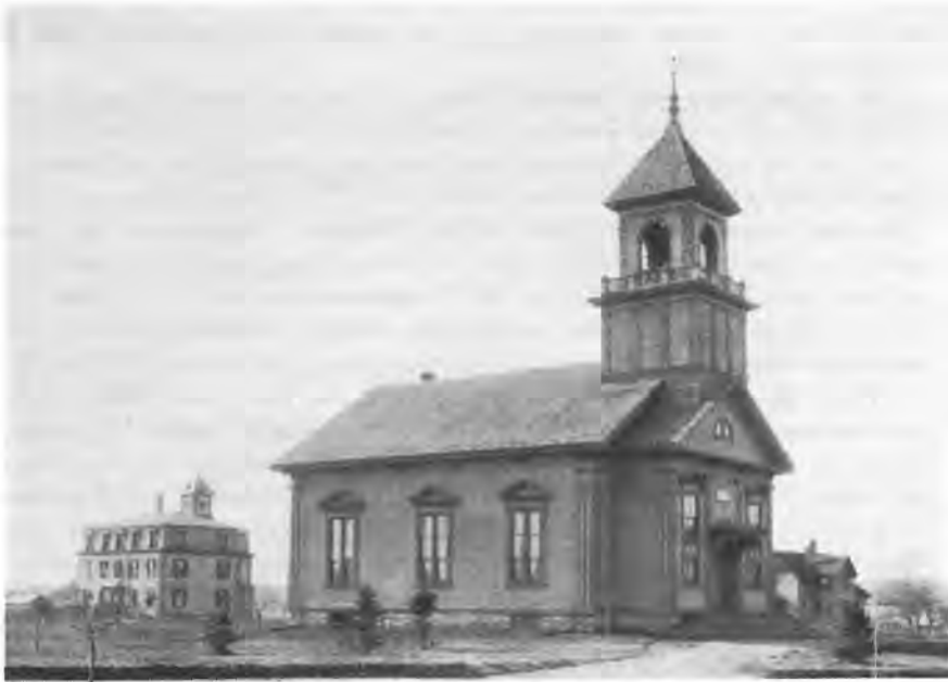
First Parish in 1880, one year after move to present location. Old Kimball School in background.

It took a bit of doing to move this Meeting House from a knoll on Nehoiden Street near Central Avenue, across a meadow and down a dirt road to the principal intersection in the Village of Great Plain. But the “doing” was much, much more than just a physical move:—feasibility—site location—agreement to move—disagreement to move—voting to move—committee to raise funds, undertake the move, make alterations and repairs. The Parish Clerk at that time, although a gifted penman, was most laconic in his reportings and no details of the actual move are to be found in his notes.